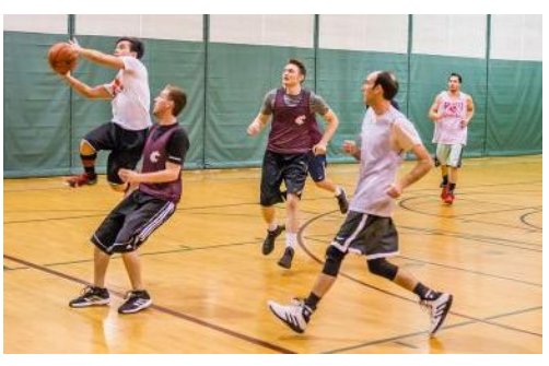
Adult Basketball Leagues

Get your team together and join us on the courts this winter. Teams will play 10 games, including a playoff for the top teams during the regular season. Team registration accepted only. Majority of games will be played on Sunday afternoons or evenings. Some games may be scheduled on Friday or Saturday evenings as needed.