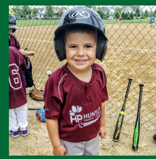
Ball Diamond Sports